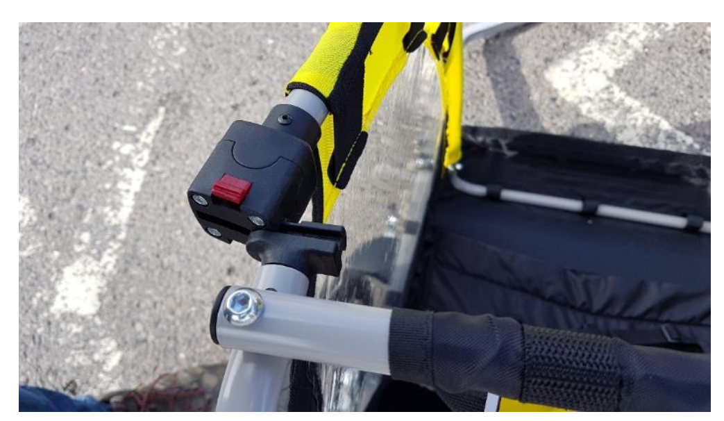
2. Slide the rods outwards to release them.