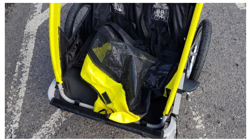
The trailer is easily collapsed by:

1. Taking off the cover via the Velcro straps.