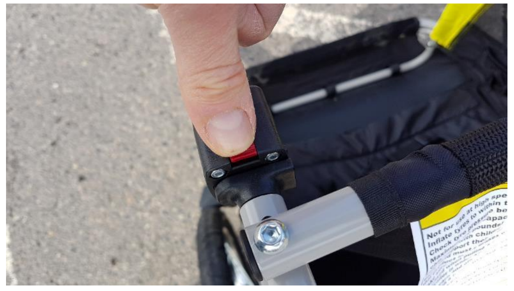
2. Pressing the red button on the 45 degree side rods.