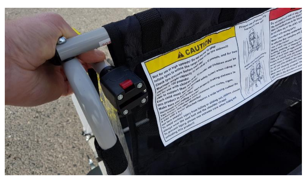
3. And then tuck them between the seat back and the vertical rod.